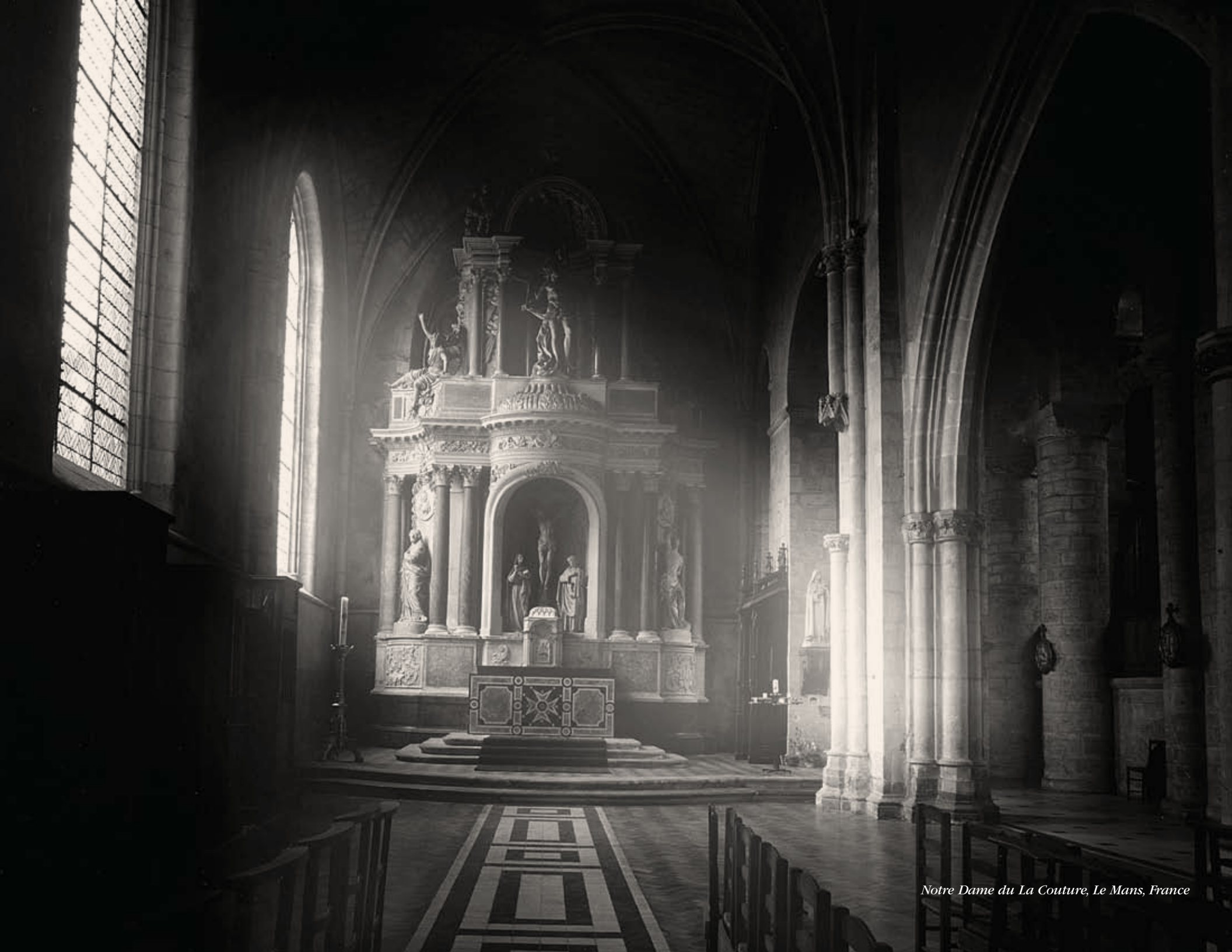
Notre Dame du La Couture, Le Mans, France