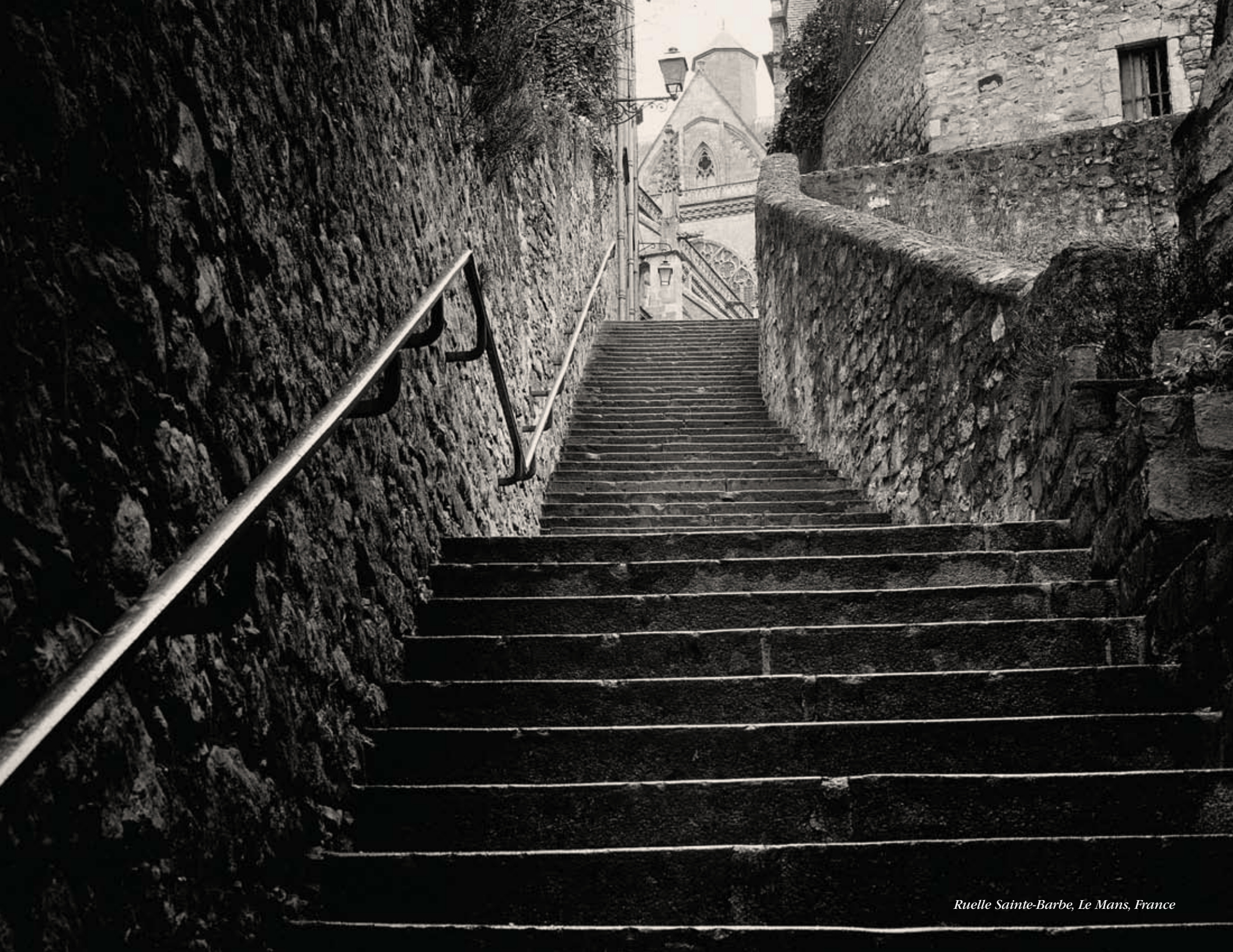
Ruelle Sainte-Barbe, Le Mans, France