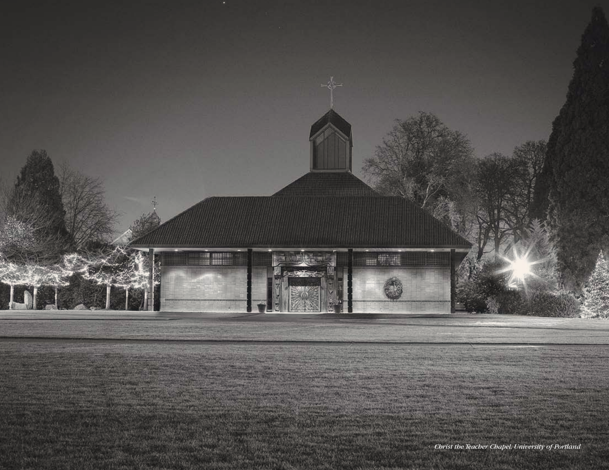
Christ the Teacher Chapel, University of Portland