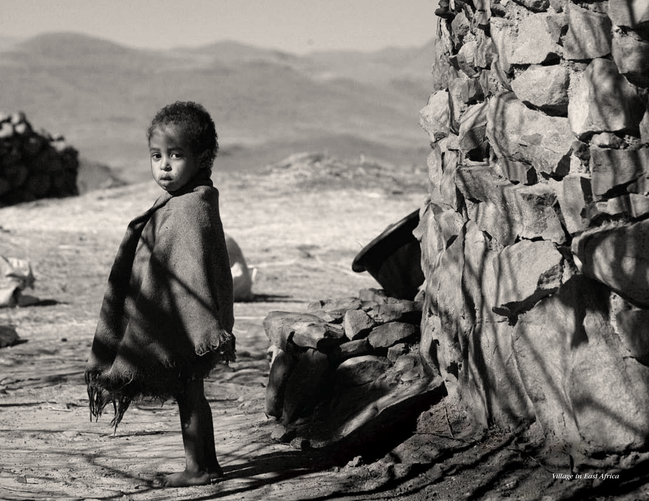
Village in East Africa