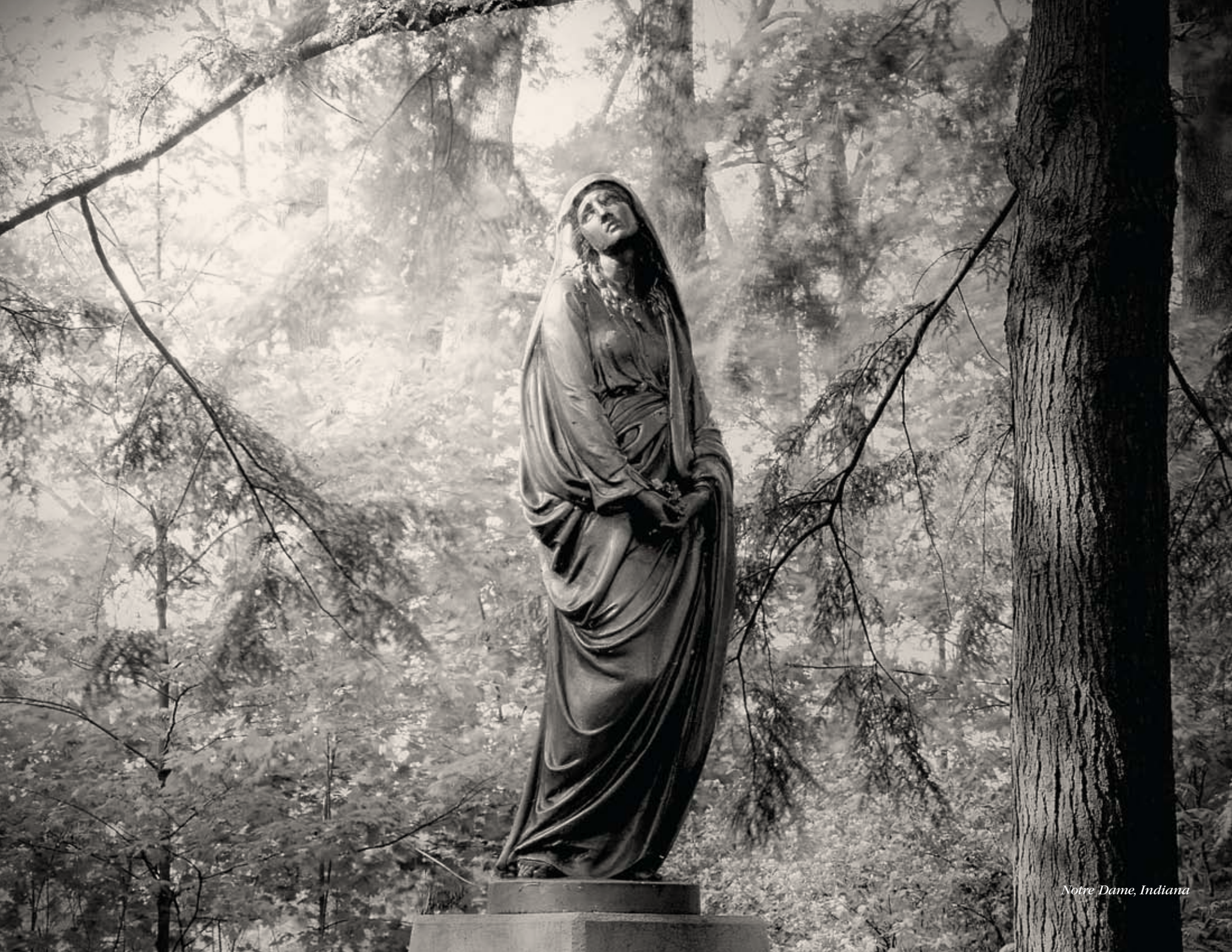
Notre Dame, Indiana