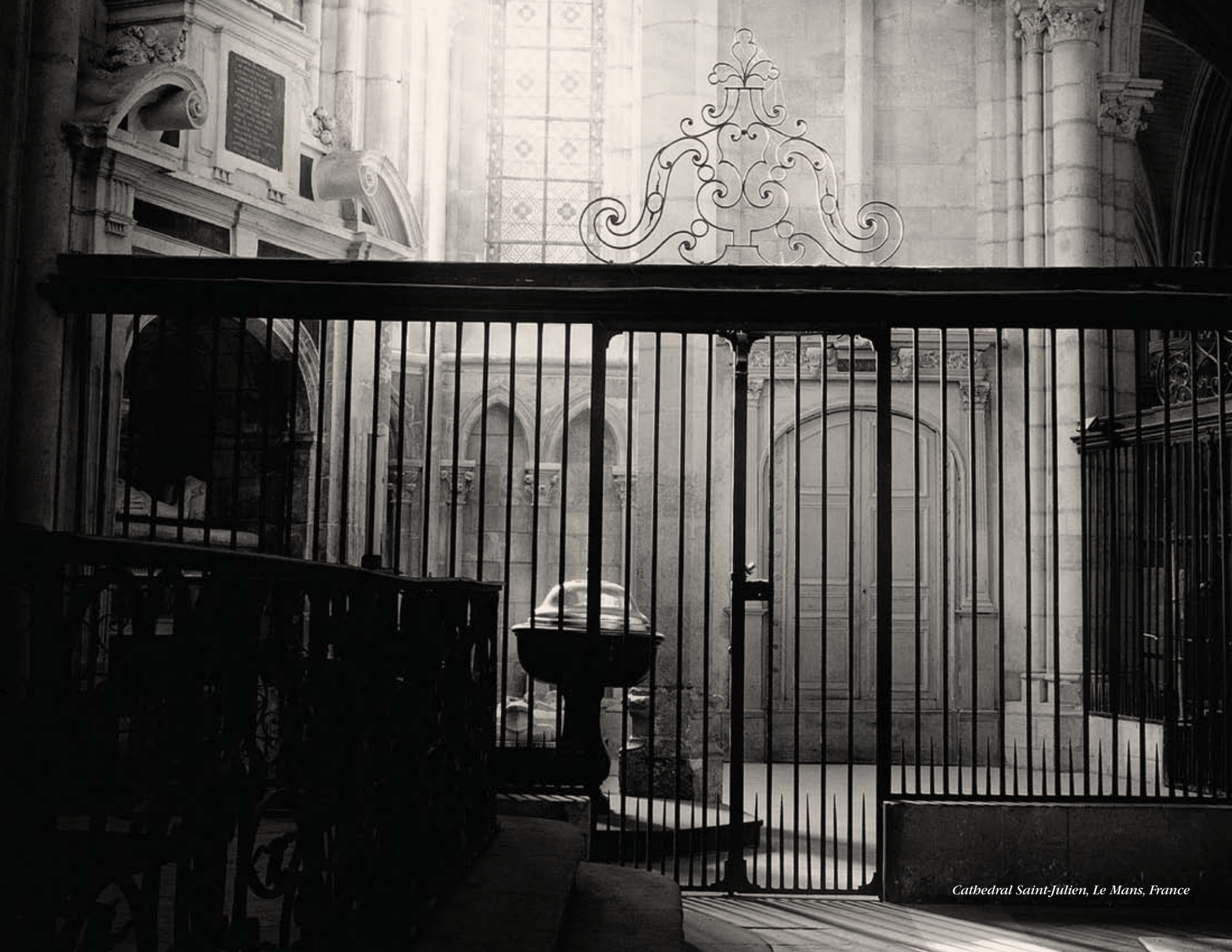
Cathedral Saint-Julien, Le Mans, France